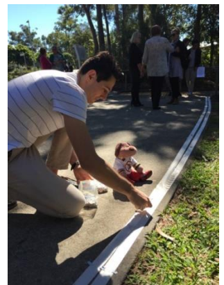
Coin km Griffith